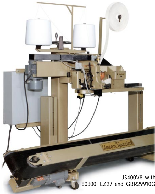
US400V8 with 80800TLZ27 and GBR29910G