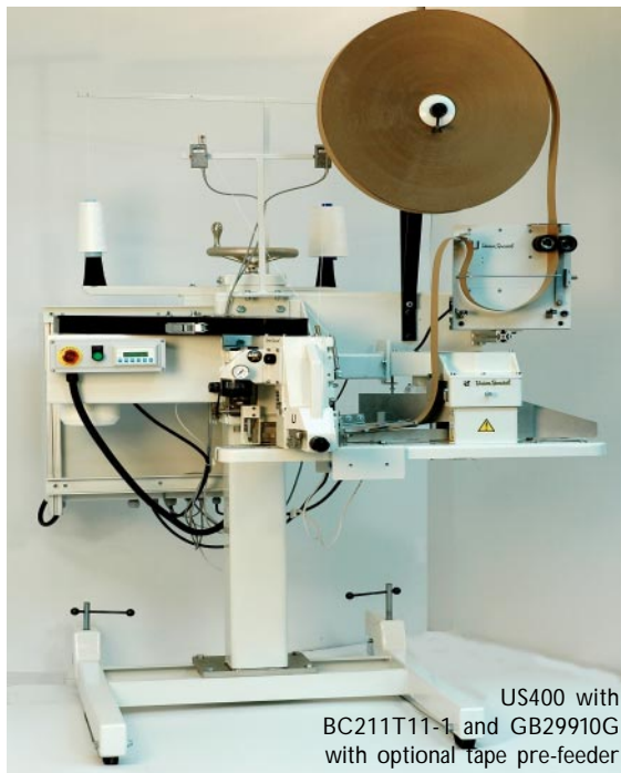
US400 with BC211T11-1 and GB29910G with optional tape pre-feeder