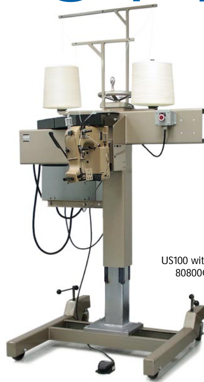
US100 with 80800C